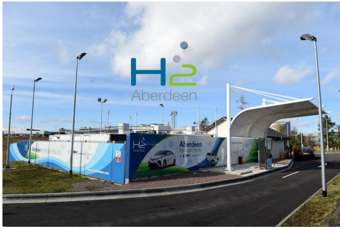
Aberdeen Hydrogen Hub: Aberdeen City Council and bp