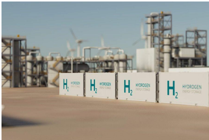
Oman Hydrogen Project