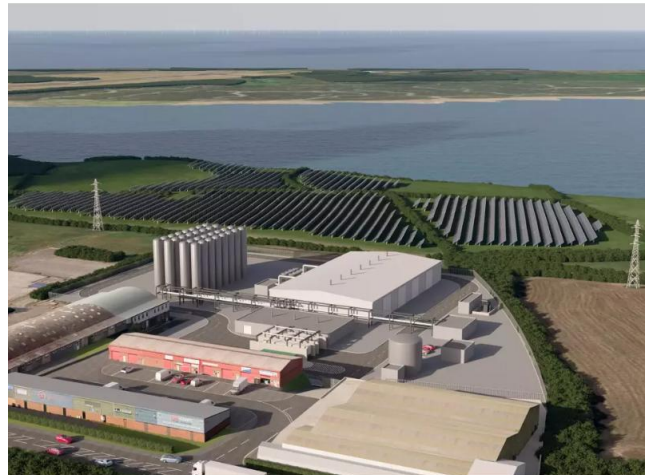
Schroders Greencoat and Carlton Power JV