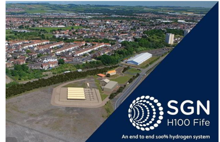
SGN H100 Fife