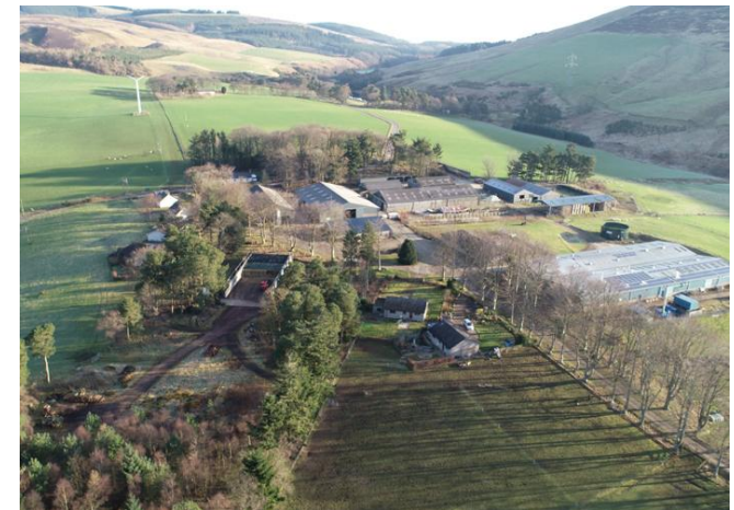
James Hutton Institute: Hydrogen Project